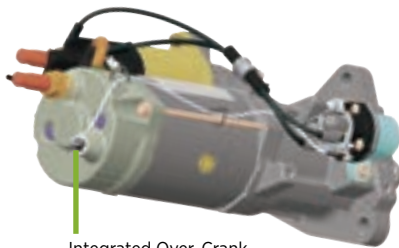
Integrated Over-Crank Protection (IOCP)

Cranks up to 4% faster than the competition